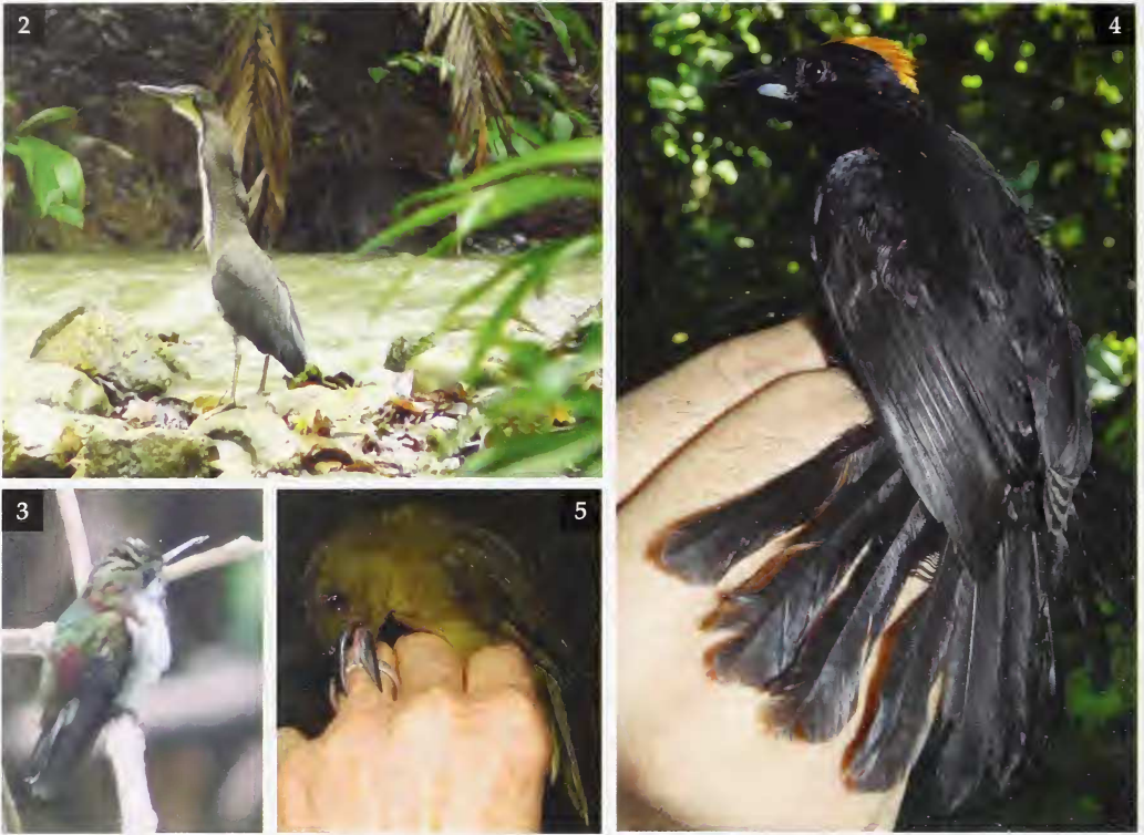
Figure 2. Fasciated Tiger Heron Tigrisoma fasciatum , Río Plátano Biosphere Reserve, Honduras, April 2009